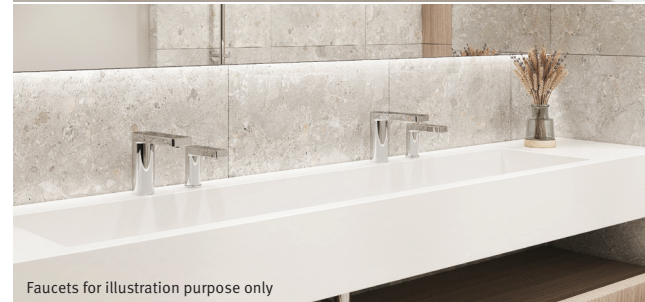
Faucets for illustration purpose only